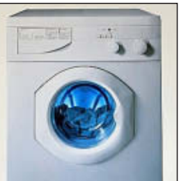
BIG CHANGES: Washer

★ A DRIPPING wet polar bear shakes itself dry – sending water droplets spraying everywhere. The snap, taken by Darren McTee from the US, was one of more than 1,000 entries in the Water, Water Everywhere photo competition. ★ It won joint top prize with an emerging hippo, shot by Matt Pretorius of South Africa. A shark swimming in the Bahamas, taken by Lukas Walter of Switzerland, and a wild dog leaping from water, taken by Emile Wessels from South Africa, came highly commended in the Pangolin.Africa charity contest.