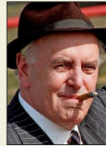
IN PAST: Arthur