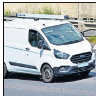
End of the road . . . for white van

He added: "It's such a lovely van to drive that I prefer it to my car. I don't just use it for work, but also for taking the